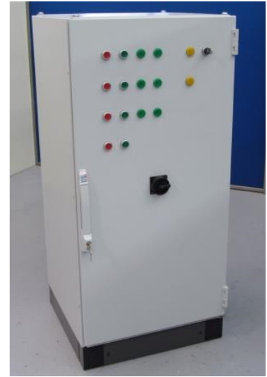
Local Control Unit

Short circuit tests in high power laboratories require fast and reliable make switches. The MTSA Make Switch 1210 fully meets these requirements: