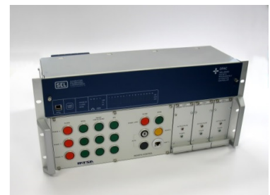
Remote Control Unit